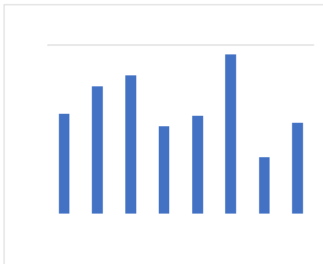
Figure 3: Time consumption by different path similarity detection approaches