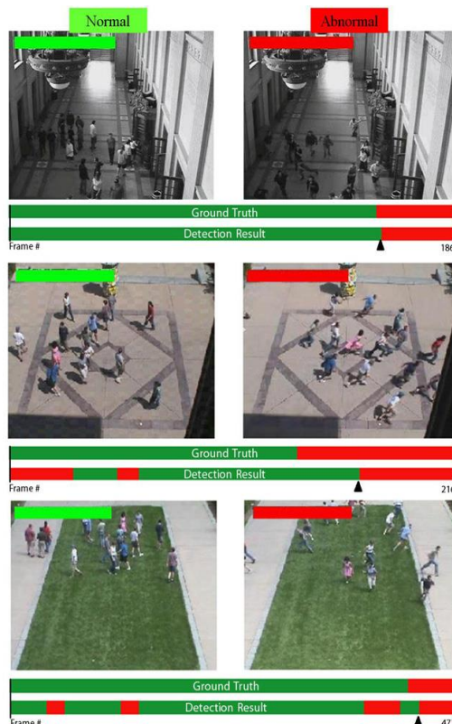
Figure 1: A sample of UMN image database

In this project, object data was required and hence, the most reliable dataset of this regard is UMN database that consisting of eleven video clips about ESCAPE event which stands for abnormality sense. Each video clip is having both normal sense and abnormal sense, the normal sense is incorporated at the beginning of each video while the abnormal sense is incorporated at the end of each video. Figure 1 is demonstrating the database video contains which depicts the normal and abnormal senses in the database.